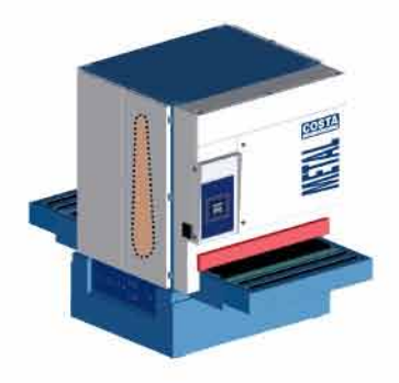
Top polishing / deburring machines