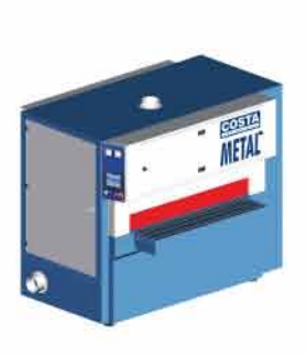
Bottom + Top deburring machines