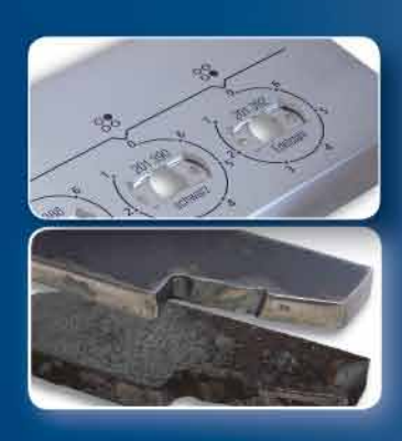
Universal Deburring / Polishing (edge rounding & oxide removal) DRY & WET Process for: Oxyflame, Plasma, Laser, Punching and Shear Cutting parts