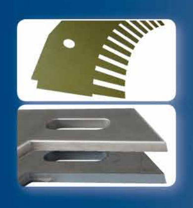
"Top + Bottom" universal deburring in a SINGLE PASS

(edge rounding & oxide removal) DRY Process for: Oxyflame, Plasma, Laser, Punching and Shear Cutting parts