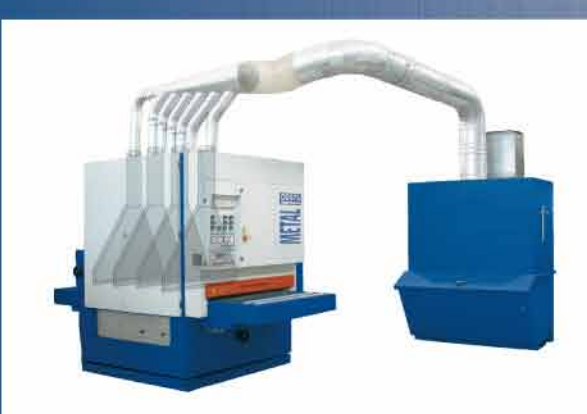
The dust generated by the working process is removed by an air flow.