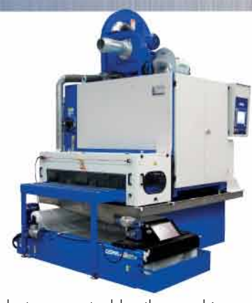
The dust generated by the working process is removed by a flow of water coolant.