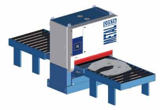
Machines installed in line with other machines or with transfer table.