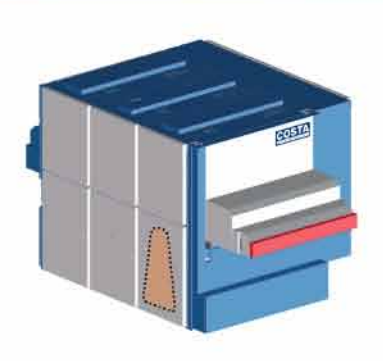
Bottom polishing / deburring machines